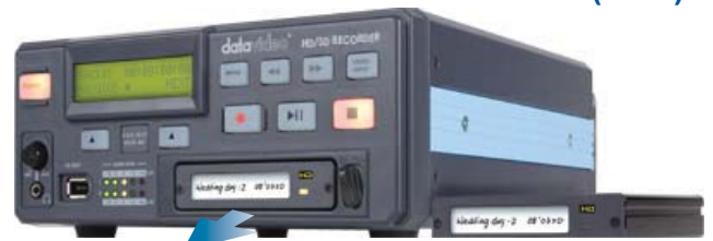
Removable hard drive