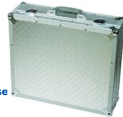
Aluminum Carrying Case

Outputs include: Component (YUV) which could be connected to a DVD recorder or projector.