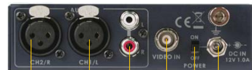
Right Audio In Left Audio In Unbalanced Audio In Composite In Power DC In 12V 1.0A