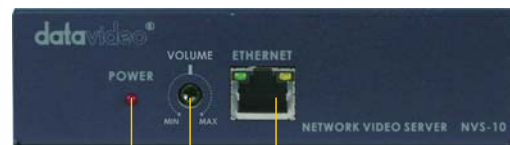
Power Volume Ethernet